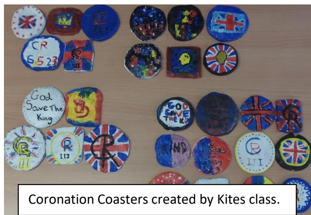
Coronation Coasters created by Kites class.

On the 5th May, Year 6 had the opportunity to take part in some fun activities to celebrate the Coronation of King Charles III. Each class took some time to enjoy their 'picnic', before finishing off decorating their 'Coronation Coasters'; they each took time to intricately decorate their coasters. They then headed off to the hall, where they had the opportunity to revel in the celebrations. Some decided to dress up as royalty, whilst others took part in traditional party games. There was merriment experienced on the bouncy castle too. Fabulous memories for everyone.