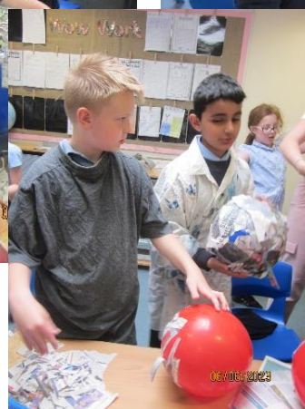
Year 4 team